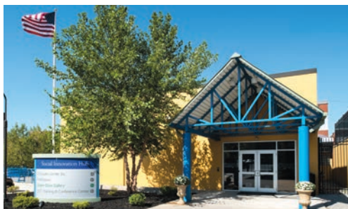
Chrysalis Center Main Campus | Hartford

Chrysalis Center Housing Development Corporation (CCHDC) is a private 501(c)3 housing development organization, established in 2022, that positively transforms urban and rural environments by developing affordable housing throughout Connecticut. CCHDC focuses on building housing for the underserved and creates quality housing throughout Connecticut that is safe and affordable and fosters a sense of home to create a healthy living environment.