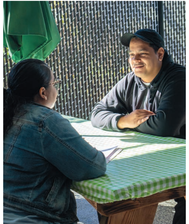
Pictured above: During the pandemic, Chrysalis Center case managers met with clients on our open air patio.

Community Support Services & Case Management is the organization's original program and focuses on providing individualized support for individuals who have a variety of mental health diagnoses, many with co-occurring substance use. Our staff provide unique and personalized care to assist participants and help them to live life well. With the support of this personalized model of services, individuals with severe and prolonged mental illness can lead stable, independent lives in their own home and the community.