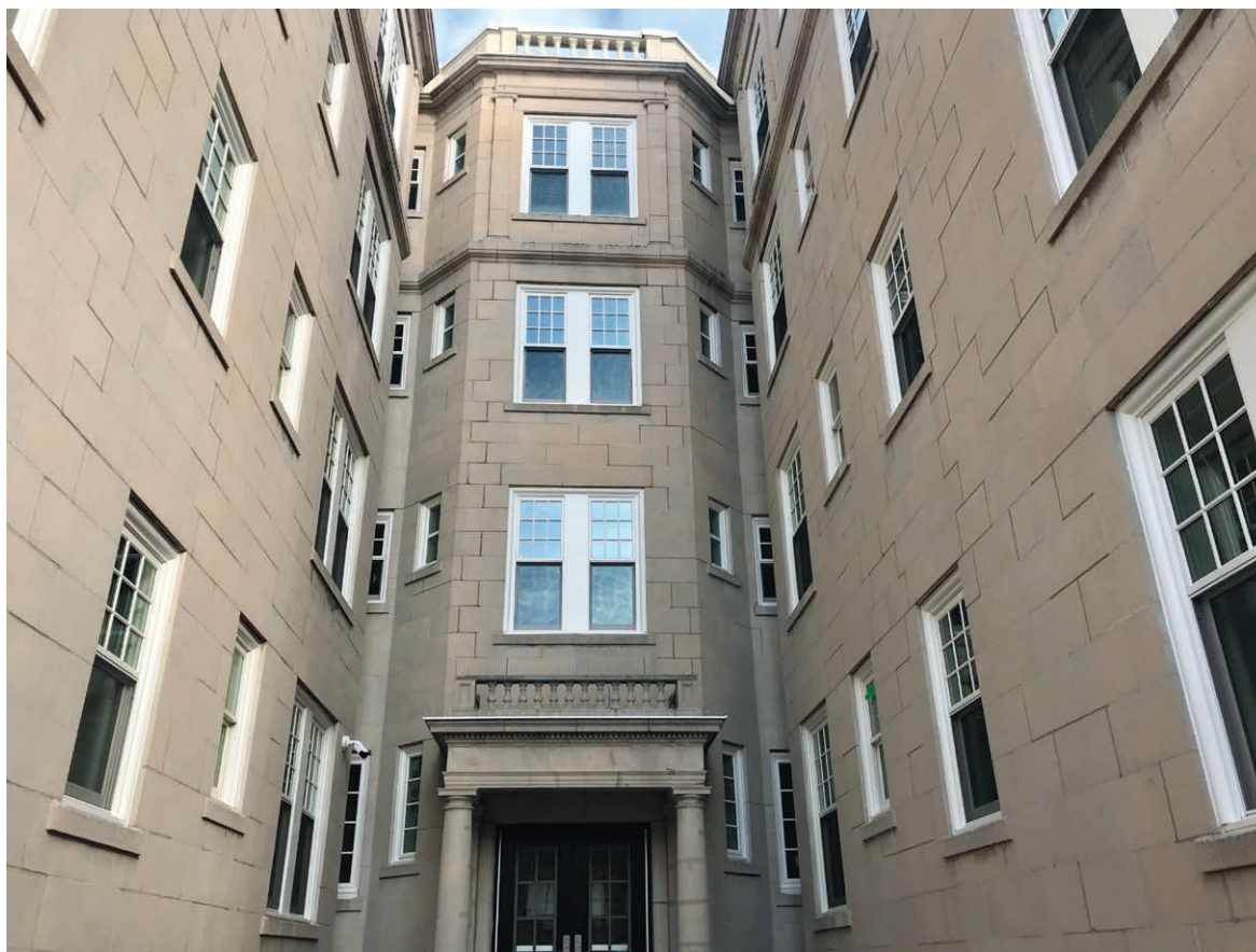
In November 2020, Chrysalis Center Real Estate Corporation opened "Courtland Arms" in downtown New Britain, which is now home to 24 individuals.

At Chrysalis Center we know that life events can often cascade into homelessness, which can exacerbate physical well-being, mental health, and substance use issues, making securing long-term housing virtually impossible. By providing a network of supportive services, our Community Supportive Housing programs help individuals and families secure safe and affordable housing, and work toward resolving/managing the issues that led them to homelessness. The goal of all our Community Supportive Housing is to help clients find and maintain stable housing long term.