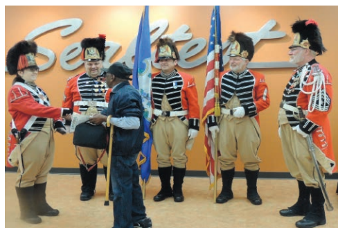
Veteran greets Connecticut Color Guard at last year's Wartime Service Medal Ceremony

The Commissioner of Veterans' Affairs in conjunction with the Adjutant General awards a ribbon and medal to each veteran who served in time of war who either was a resident of this state at the time he or she was called to active duty for such service, or lives in Connecticut on the date of such award.