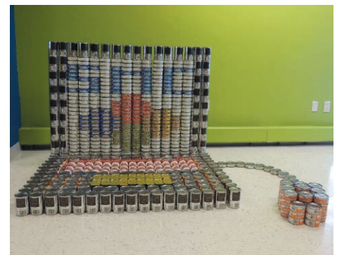
Last year's winning sculpture by SMC Partners of Hartford

Judges will review the sculptures and the "Top Can" award will be awarded for the three best designs. All entries will be posted to the Chrysalis Center website at www.ChrysalisCenterCT.org .